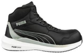
ZOOM BLACK MID 635030