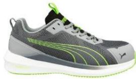
SLIDE GREY/GREEN LOW 654010