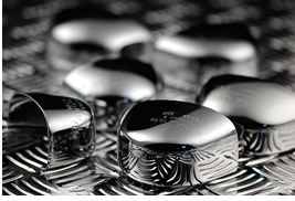
Steel toe cap