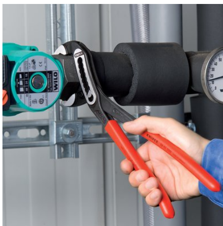
Self-locking on pipes and nuts: no slipping on the workpiece; the complete actuating force can be used to turn the workpieces; not having to squeeze the pliers handles reduces the required effort